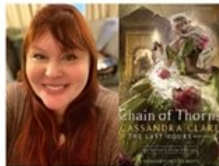
Cassandra Clare #1 New York Times bestselling author of The Mortal Instruments Series