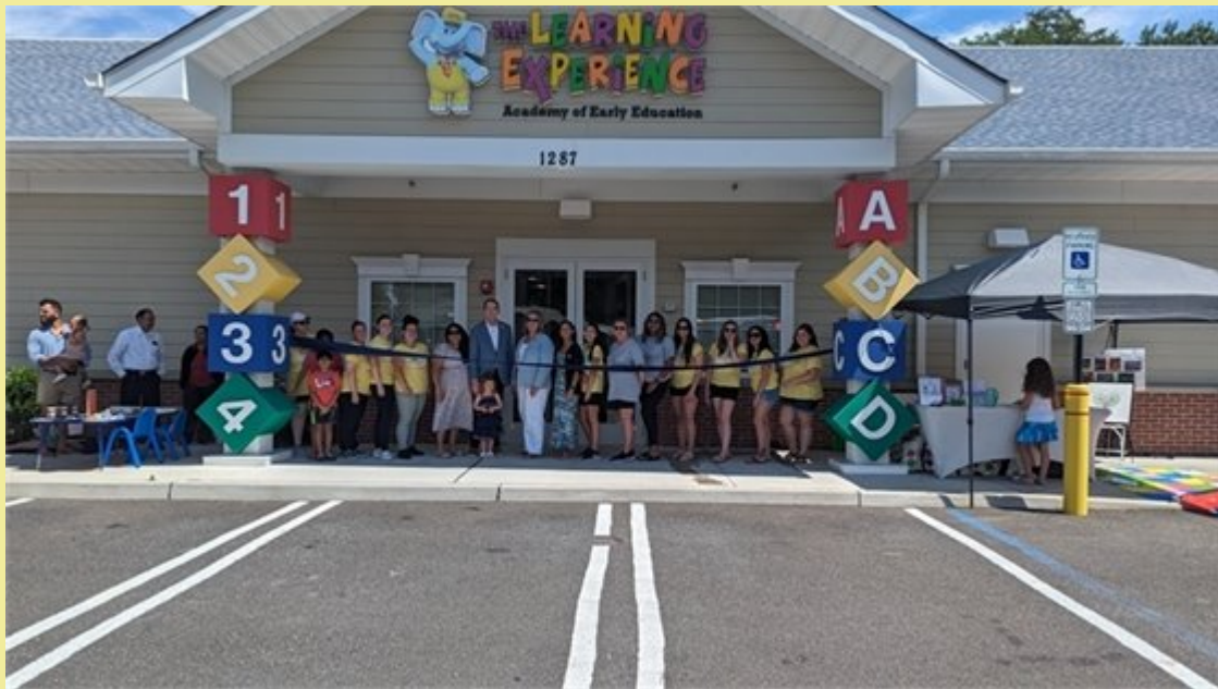
Mayor Perry and Committeewoman Kratz join The Learning Experience employees and patrons for the grand ribbon cutting!

Last weekend, Mayor Tony Perry and Committeewoman Kimberly Kratz were thrilled to join The Learning Experience (1287 NJ-35) at its Foam Party & Touch-a-Truck Carnival! Since the childhood education center opened during the pandemic, it decided to incorporate its official ribbon cutting at this fun event.