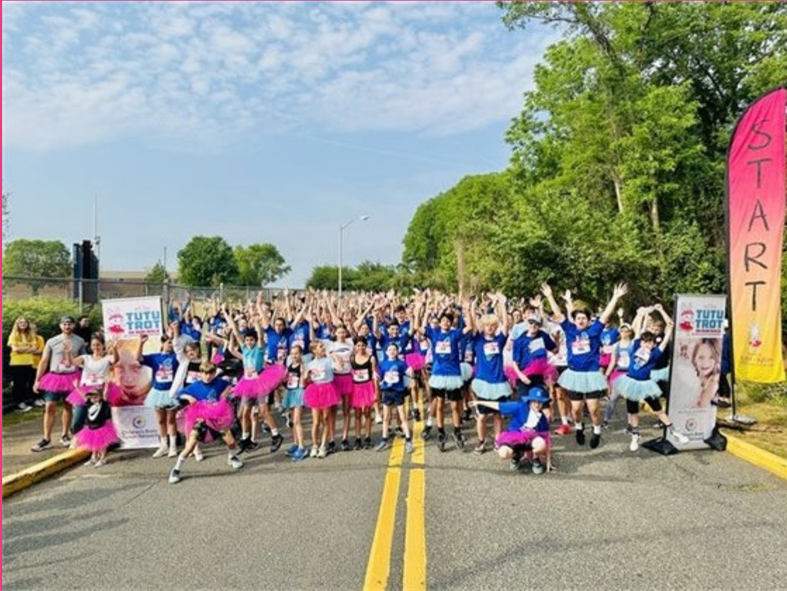
A sea of participants in tutus raise their arms in excitement before the race.

Last Sunday, over 400 community members participated in Middletown-based nonprofit Infinite Love for Kids Fighting Cancer's Annual Tutu Trot 5K, which has raised $62,000 and counting!