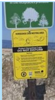
Horseshoe crab sign at Leonardo Beach

nonprofit Save Coastal Wildlife to create informative signs about horseshoe crabs at Leonardo Beach and Ideal Beach. The bright yellow signs were installed to alert and inform visitors about another visitor that briefly comes ashore every year!