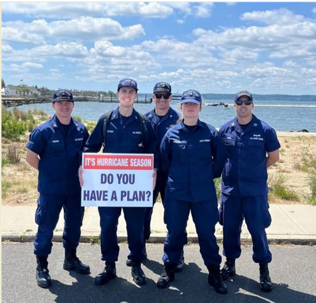
U.S. Coast Guard Station Sandy Hook representatives show off OEM's hurricane preparedness sign!

The Atlantic hurricane season officially began on June 1 st ! Middletown's Office of Emergency Management (OEM) and U.S. Coast Guard Station Sandy Hook strongly encourage residents to create an emergency plan.