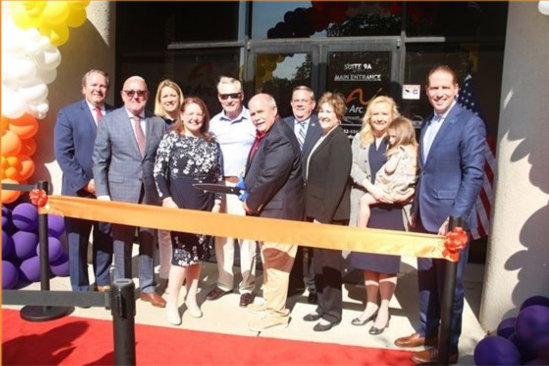
Local elected officials accompany Arc of Monmouth employees for its ribbon cutting.

Earlier this week, Mayor Tony Perry visited Wall Township to commemorate the grand opening of The Arc of Monmouth's new day center facility (1345 Campus Parkway), which brings three of its adult day programs under one roof. The Arc of Monmouth is a local nonprofit that empowers individuals with intellectual and developmental disabilities through a variety of programs, including some that take place in Middletown.