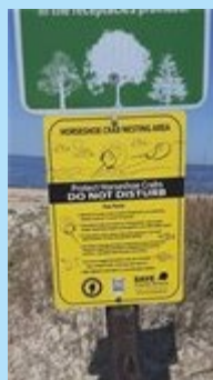
Horseshoe crab sign at