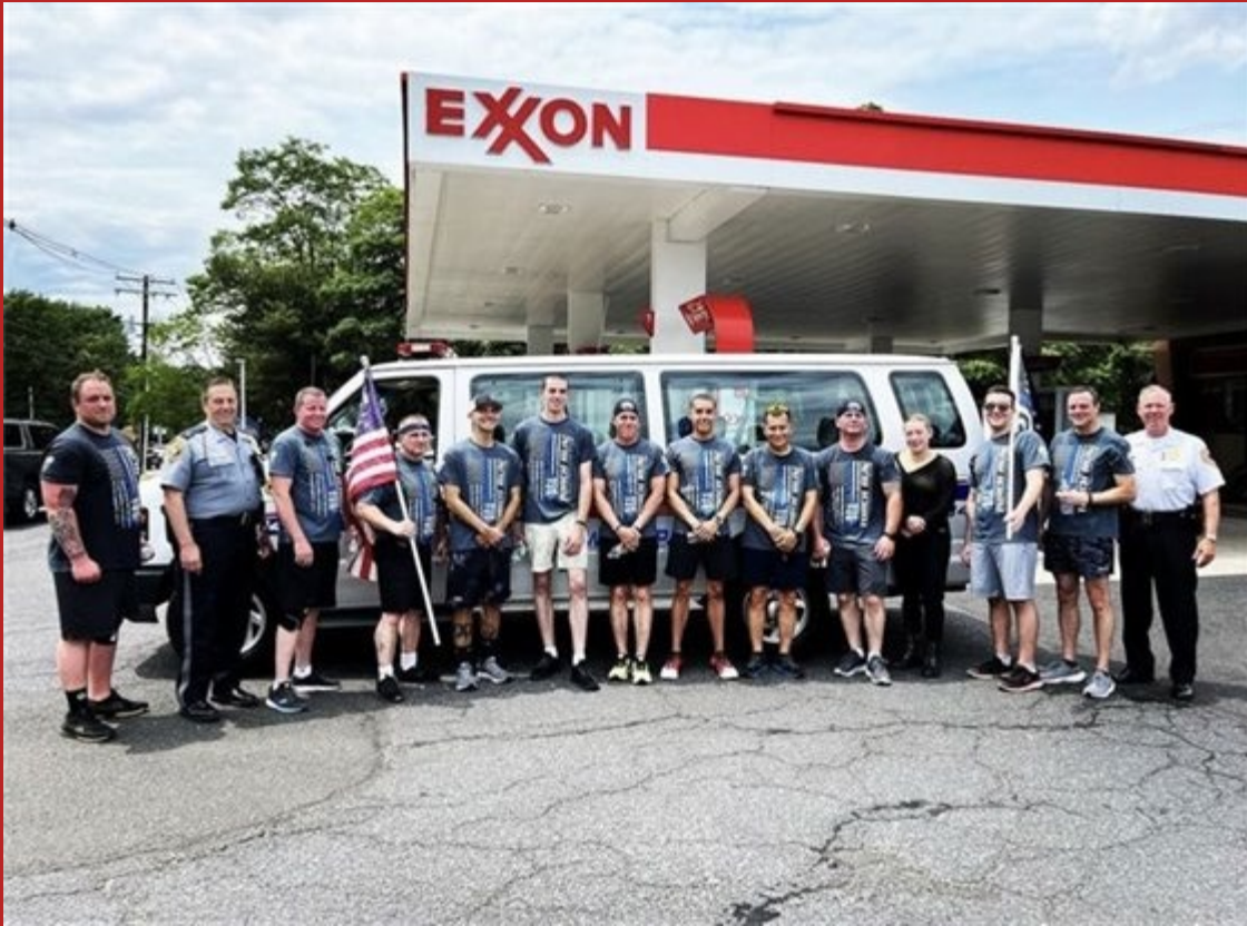
MTPD officers and Middletown PBA 124 members gather for a group photo after passing the "Flame of Hope" to the Holmdel Township Police Department!

Earlier today, the Middletown Township Police Department (MTPD) and Middletown PBA 124 participated in the 40 th annual Law Enforcement Torch Run to raise funds for the Special Olympics of New Jersey (SONJ). The run spans over 750 miles and 26 routes as officers carry the "Flame of Hope" throughout the state. MTPD officers received the torch from the Red Bank Police Department and passed it to the Holmdel Township Police Department.