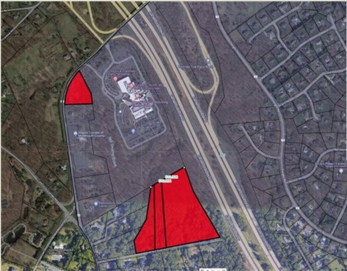
Map of proposed properties for development near Exit 114

At the Monday, June 5 th Township Committee Meeting, the Middletown Township Committee unanimously approved an ordinance that authorizes the acquisition of four properties to help preserve open space and improve both public recreational opportunities and economic growth. The ordinance was originally introduced at the Monday, May 15 th meeting.