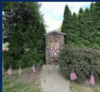
World War II Memorial at Croydon Hall

On Memorial Day, several Township Committee members paid their respects to our fallen veterans by attending services at different war memorials and cemeteries throughout the Township. Although the day of observance has passed, Middletown will continue to recognize and honor those who made the ultimate sacrifice for our nation every day of the year.