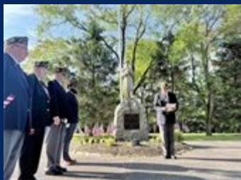
29th Regiment New Jersey Volunteer Infantry Civil War Memorial in Fairview Cemetery