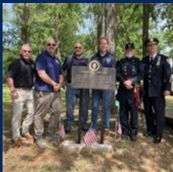
Dedication plaque at Cedar View Cemetery