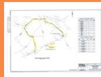
Map of Navesink River Road detour (PDF)

Visit www.middletownnj.org/nixle to register for Nixle and receive traffic alerts.