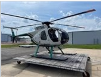
Pictured above is the helicopter that will be used.