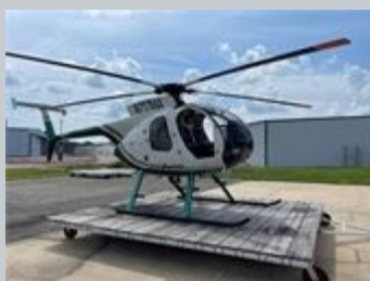
Pictured above is the helicopter that will be used.