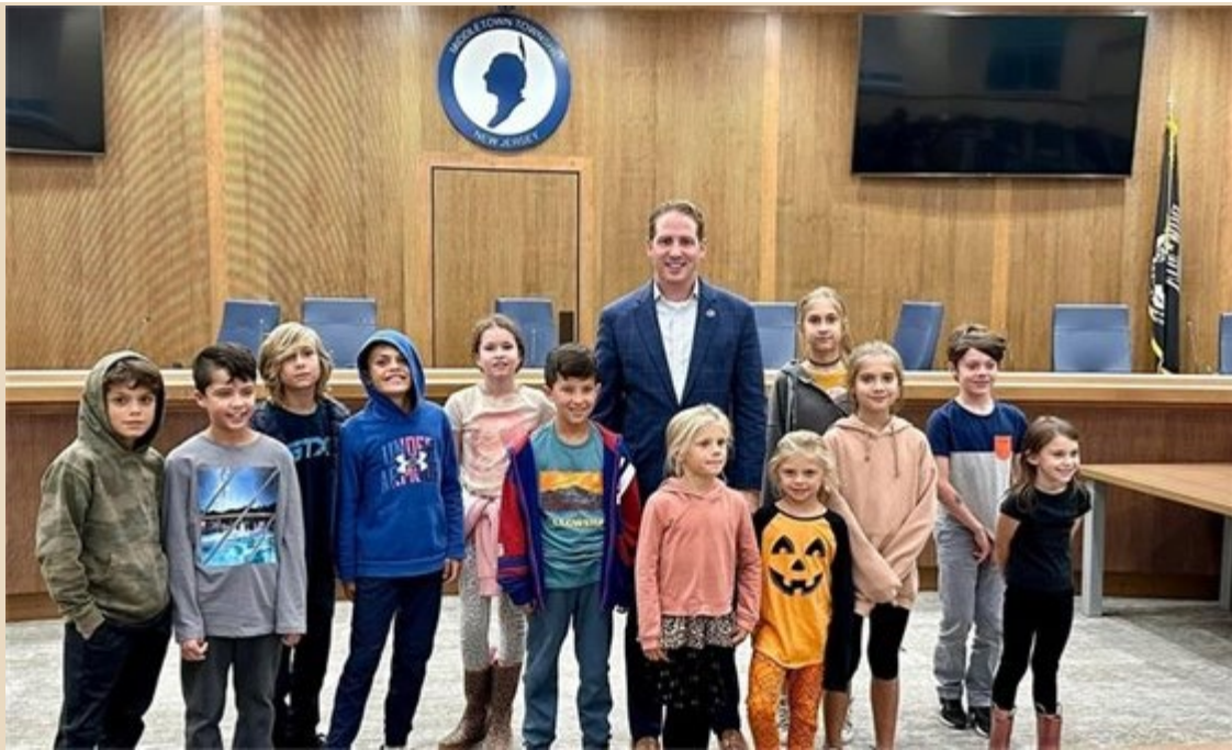
Mayor Perry and the group of students check out the courtroom at Town Hall!

Earlier this week, Mayor Tony Perry met with one of Middletown's homeschooling groups for a class trip at Town Hall! Students visited the courtroom and Mayor's Office, where they participated in a mock Township Committee meeting. Mayor Perry spoke about the role of government and listened to the students' different proposals for Middletown.