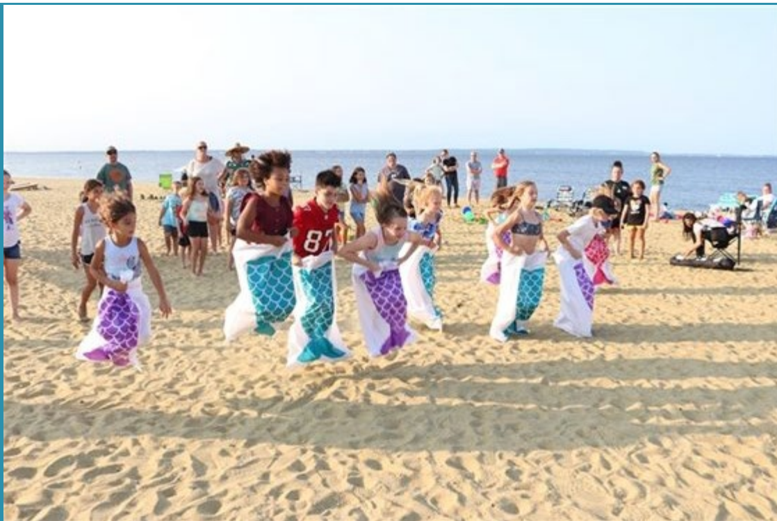
Residents put on their mermaid tails and race to the finish line!

From sand art to a mermaid race to a watermelon eating contest, Middletown Recreation's beach bash was waves of fun! Thanks to all our residents who came out to enjoy what local summer is all about — great weather and an even greater community!