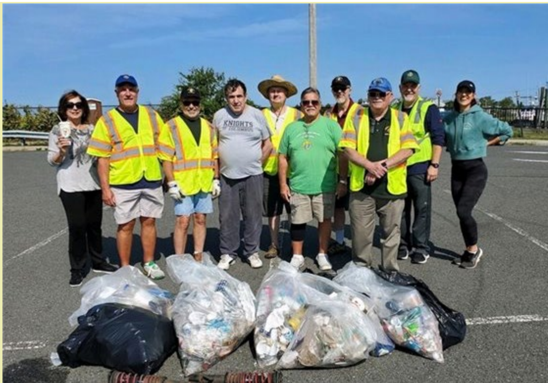
Members of the Vincent T. Lombardi Knights Of Columbus Council #6552 pose with our Department of Public Works & Engineering (DPW) employees and the trash they collected!

Last Saturday, the Vincent T. Lombardi Knights Of Columbus Council #6552 participated in the Township's Clean Communities Mini Grant Program by picking up over 100 pounds of litter near the Belford Seafood Co-Op that would have otherwise polluted our waterways. We are so grateful to the Knights of Columbus for being a part of this program and everything they do for Middletown!