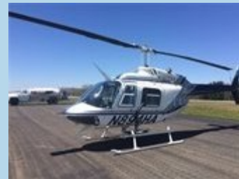
The helicopter used for these patrols will be a Helo-Air, Blue and White Bell 206, Tail number - N894H.

Jersey Central Power & Light (JCP&L) would like to advise the community that Helo-Air will be mobilizing to the JCP&L Region from 8/11/22 – 8/18/22 and will begin performing Routine patrols on all JCPL 500kV, 230kV, 115kV lines (weather-permitting). These patrols are expected to take approximately one week to complete, but as always, work is strongly weather-dependent and completion could be impeded by any post-storm or outage-related patrols that may occur.