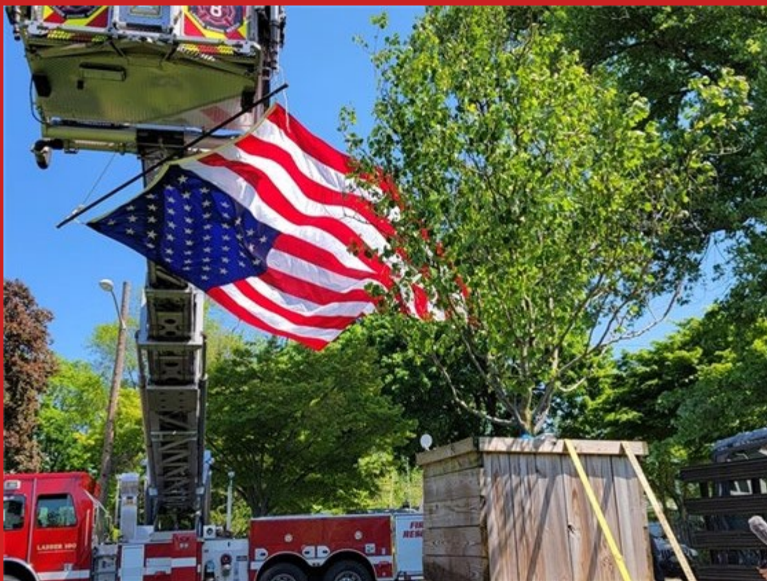
The clone of the 9/11 Survivor Tree stands tall next to an American flag being flown by the Middletown Township Fire Department.

Last week, Middletown Township held a ceremony welcoming a clone produced from the original 9/11 Survivor Tree graciously donated by the New York City Department of Parks & Recreation (NYC Parks) to the Middletown World Trade Center (WTC) Memorial Gardens, located next to the Middletown Arts Center (36 Church Street).