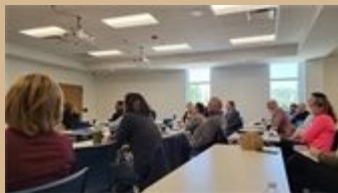
Small-business owners listen attentively and take notes.