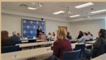
Mayor Perry discusses how government and businesses can work better together.