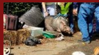
MTFD and Middletown Animal Control combine forces to safely

Earlier this week, the Middletown Township Fire Department (MTFD) was dispatched to a basement fire in a residential home that had many hospice animals. Our all-volunteer firefighters and Middletown