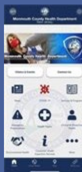
Screenshot of the MCHD app

Click HERE to view the state's data dashboard.