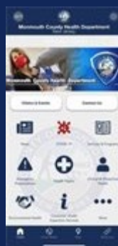
Screenshot of the MCHD app