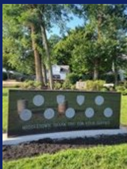
First responder/military memorial

The Middletown Recycling Center (52 Kanes Lane) will also be closed on Monday, September 6 th . It will reopen on Thursday, September 9 th at 8:30 AM. Garbage in the North Zone will still be collected on Monday, September 6 th .