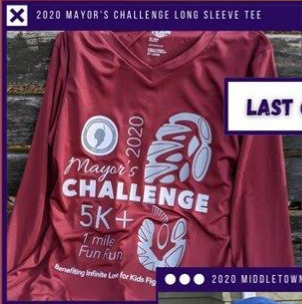
X 2020 MAYOR'S CHALLENGE LONG SLEEVE TEE