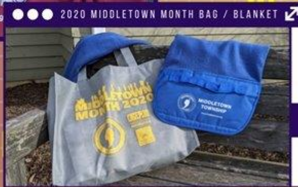
●●● 2020 MIDDLETOWN MONTH BAG / BLANKET ↗