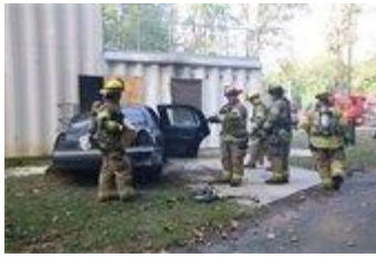
Firefighters assess a situation upon arrival and perform vehicle rescue.