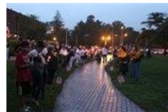
Candles burned brightly for those we lost in our community.