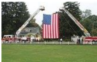
The MTFD Independent Fire Company Ladder 790 and 71190 proudly raised the U.S. flag at the memorial service.

Photo: Mayor Kevin Settembrino and Committeeman