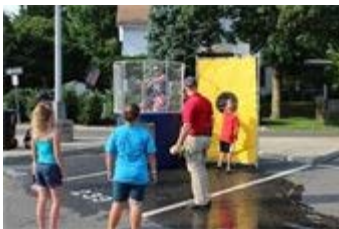
Residents lined up at the dunk tank to try to soak some members of the MTPD!