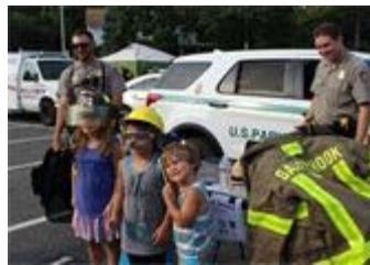
Kids had fun trying on the Sandy Hook Park Rangers' equipment.