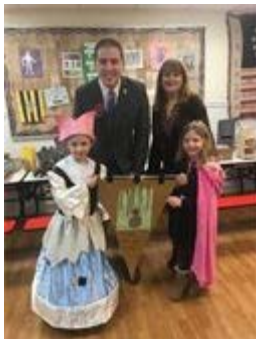
Oak Hill Academy teacher and Littletown Day Coordinator

Click HERE to learn more about the Junior Achievement and the programs they have to offer!