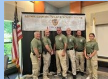
Some of the dedicated MTPD officers who help make Police Youth Week a wonderful learning experience for the kids.

Middletown Township Police Department (MTPD) just held its first Police Youth Week Camp of the summer! There were 60 children, between the ages of 8 to 11, who participated in this program that gave them their first exposure to law enforcement at the recruit phase. The Police Youth Week program, run by Detective Ric Cruz, is a combination of classroom style learning and physical training. Participants learned firsthand about a wide variety of law enforcement training and techniques including officer safety, internet safety, crime scene investigations, traffic enforcement, and the K-9 unit. The program also emphasized the importance of citizenship and community policing.