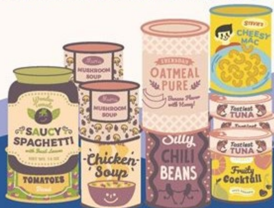
Middletown Department of Health

Middletown Social Services will not be accepting donations of any kind. If you would like to donate food to Middletown Helps Its Own , please call (732) 787-3604. For other Social Service needs, contact Monmouth County Social Services at (732) 431-6000.