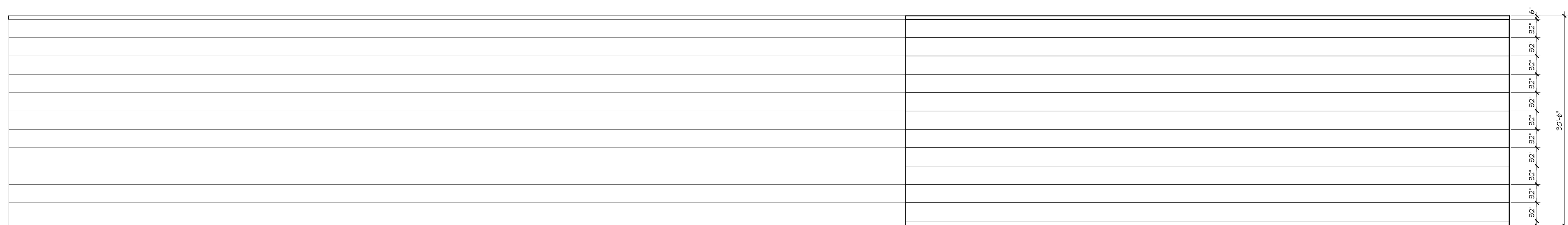
2 PROPOSED EXTERIOR CONCEPT ELEVATION SOUTH - REAR VIEW SCALE: 1/8"=1'-0"