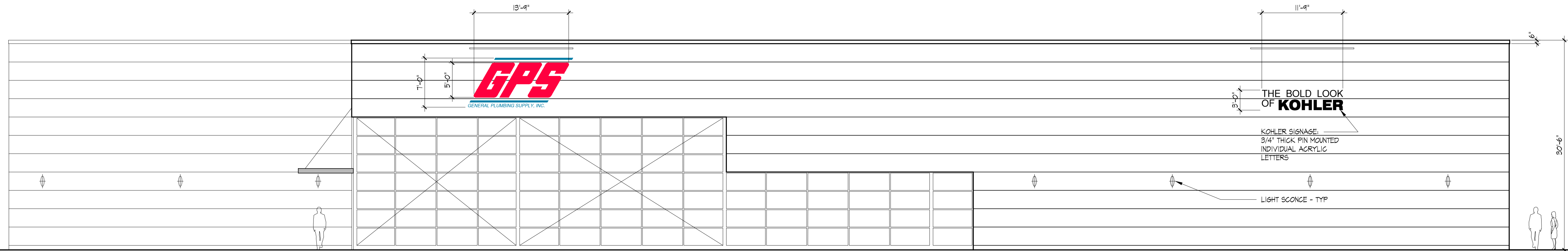
1 PROPOSED EXTERIOR CONCEPT ELEVATION NORTH - RT 36 VIEW SCALE: 1/8"=1'-0"